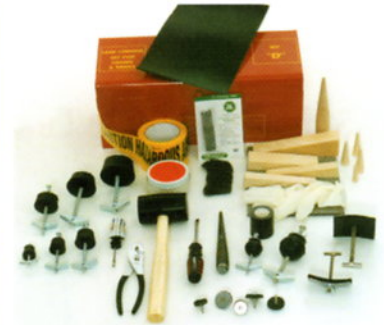
KIT D – For Drums

Kit 'AE' contains items for larger holes, cracks and gashes in addition to the standard items listed above. These include one 8" x 12" stainless steel plate lined with 3/4" thick soft neoprene material and three T-bolts with preassembled wingnut washer combos. A second 8" x 12" stainless steel neoprene backed plate is included with hardwood cribbing ladder patch and two 22' heavy-duty nylon straps.