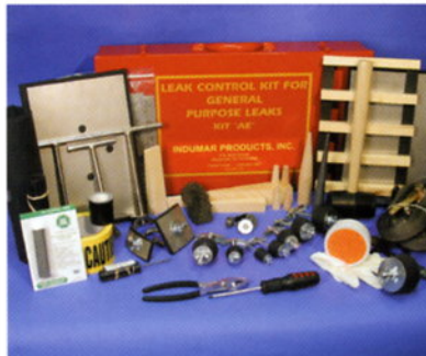
KIT AE – For Tanks, Vessels, Drums

Kits 'AE' and 'D' contain two toggle-bolt ball plugs, six toggle-bolt surface plugs, two T-bolt crack patches, five self tapping screw patches, nine assorted wooden plugs, Fix Stix™ Epoxy, Plug-N-Dike™ Plug Pattie, lead wool pack, hot/cold hose repair tape, sorbent pad, tubeless tire repair kit, 8" x 12" solid neoprene and 20" x 20" closed-cell foam gasketing material, steel drift pin, OSHA approved 200' roll of barricade tape, tools for installing all patches and heavy duty carrying case.