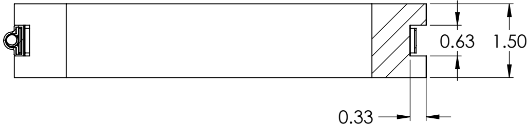
SECTION VIEW SECTION B-B SCALE 1 : 2